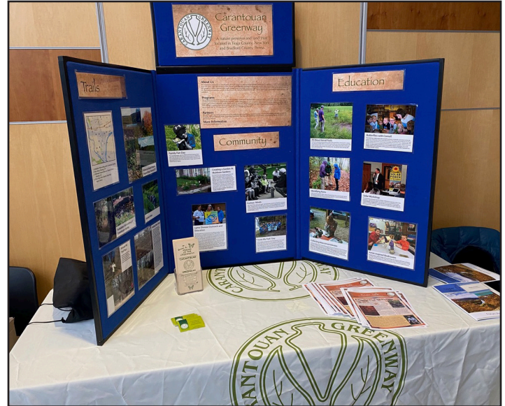
Greenway outreach display at USC forum

The Upper Susquehanna Coalition excavator operator created three vernal pools at the Carantouan Greenway's Wildwood Preserve in the Town of Barton. Vernal pools, which are shallow isolated pools of water, are critical breeding grounds for threatened amphibians such as our wood frogs and spotted salamanders. These temporary pools provide reduced predator sites (fish) and a variety of solar exposure and developmental rates for the tadpoles and larvae. The project was only feasible with the cooperation of the Upper Susquehanna Coalition, Tioga County Soil and Water and the Carantouan Greenway. The Greenway invites the public to walk its trails and visit these newly seeded venues. Additionally, the USC offers many programs and forums to educate agencies and individuals in conservation practices, funding projects and advocating for clean water.